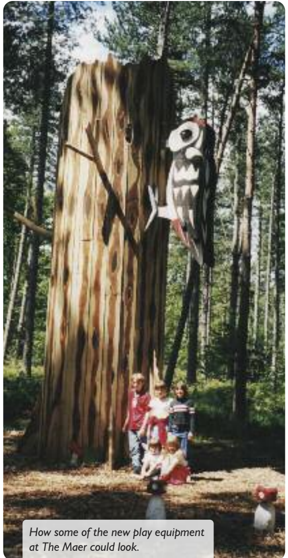
How some of the new play equipment at The Maer could look.

East Devon District Council will work with an environmental artist and with the community to create a £78,000 play area that delivers the twin benefits of providing enjoyment for families whilst informing them about the botanical and wildlife interest of the reserve.