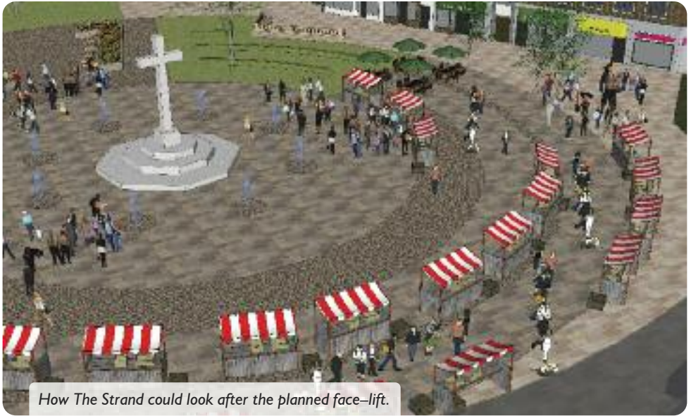
How The Strand could look after the planned face–lift.

Devon County Council, East Devon District Council and Exmouth Town Council are working together on a scheme to create an exciting new design for The Strand. The plan is to retain the War Memorial, but to make the rest of this large space more people–friendly, capable of being used for picnicking, concerts, fairs and other events that will draw residents and visitors into a vibrant town centre.